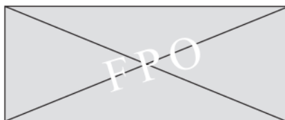
FIGURE 1. To format a figure caption use the \LaTeX template style: Figure Caption. The text “FIGURE 1.” which labels the caption, should be bold and in upper case. If figures have more than one part, each part should be labeled (a), (b), etc. Using a table, as in the above example, helps you control the layout.

Рисунок может состоять из нескольких картинок каждая из которых маркируется так